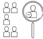
Precise count of passengers

Optimise your fleet, create efficient routes, maximise passenger comfort and reduce fare evasion by counting the passengers getting on and off your vehicles. Get accurate passenger counts, real-time occupancy levels, and historical reports all in one place.