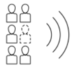
Instant updates on the number of passengers on board