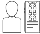
Availability of passenger occupancy data through external apps and APIs.