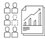
Reports on passenger counts and trends over time