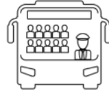
Display of passenger count information for drivers on the vehicle